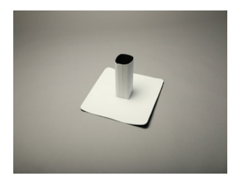
Square Tube Wrap