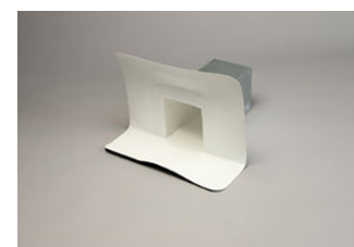
Thru Wall Scupper