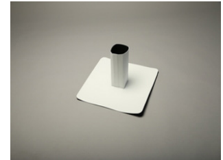
Square Tube Wrap