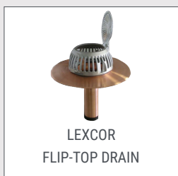
LEXCOR FLIP-TOP DRAIN