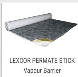
LEXCOR PERMATE STICK Vapour Barrier