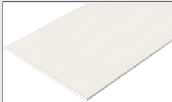
LEXCOR LEXBOARD 90 Panel